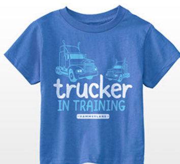
Blue Trucker in Training.