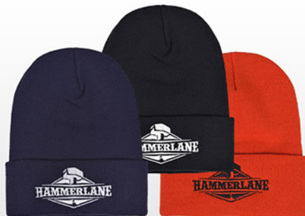
Original Hammerlane Beanie