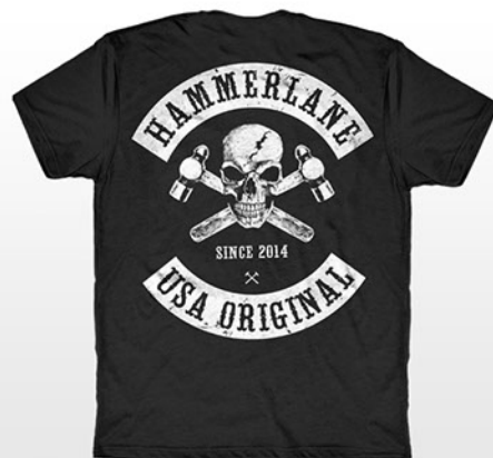
USA Original "Skull"