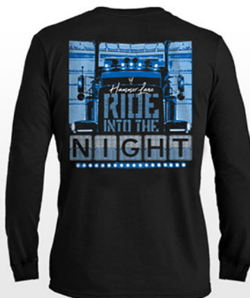
Ride Into The Night LS