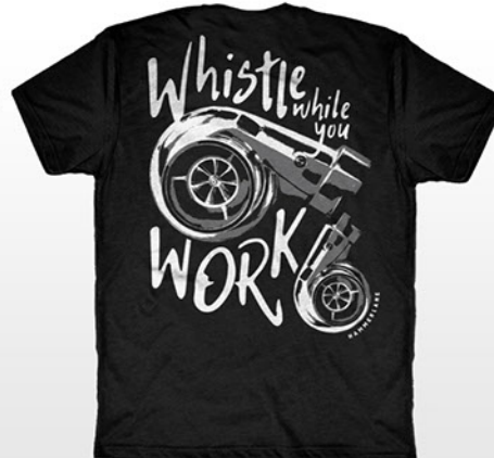
Whistle While You Work.