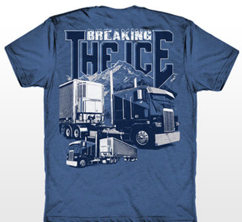
Breaking The Ice.