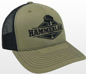
Army Green Snapback Hat