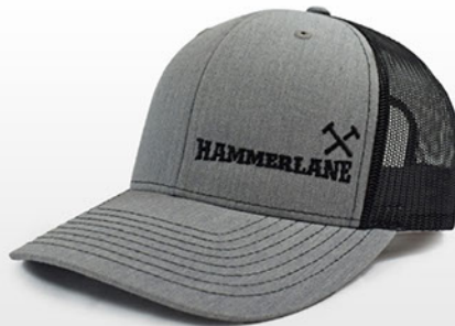
Heather Gray CH Snapback