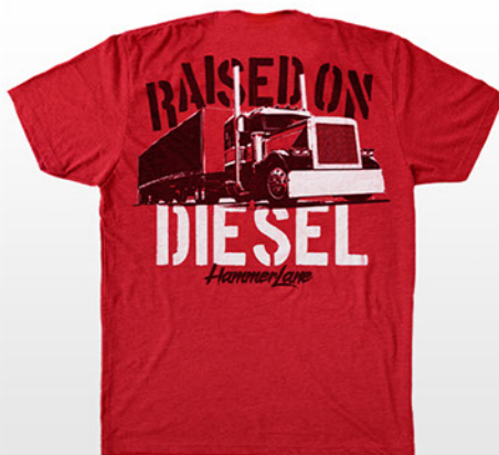
Raised on Diesel.