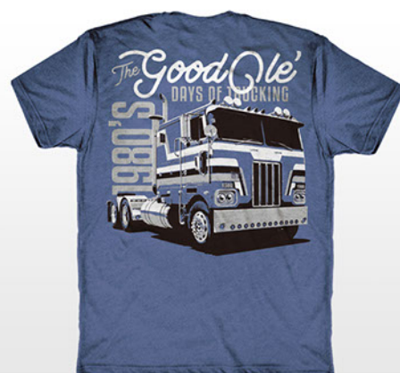
Good Ole' Days.