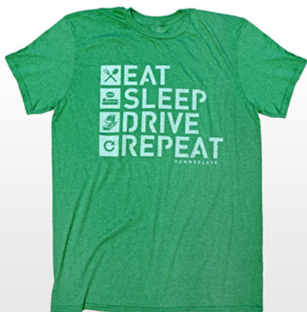
Eat. Sleep. Drive. Repeat.