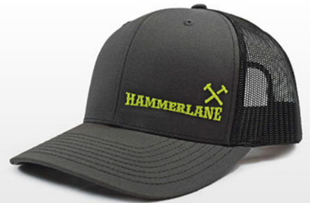
Charcoal/Neon CH Snapback