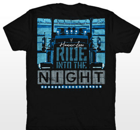
Ride Into The Night.