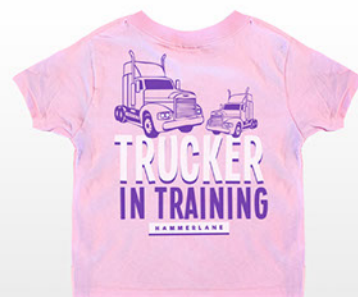
Pink Trucker in Training.