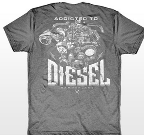
Addicted to Diesel.