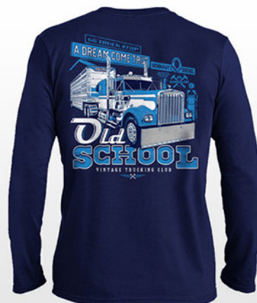
Old School LS