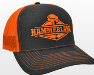
Hammerlane Neon Truck Hats