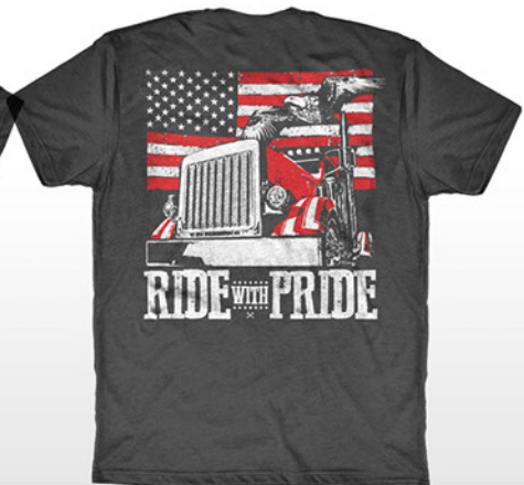
Ride With Pride.