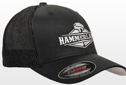
Original Fitted Mesh Hat