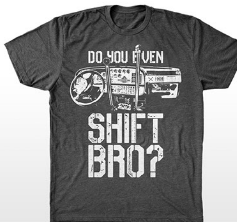
Do You Even Shift Bro?