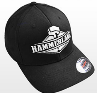
Original Hammerlane Hat