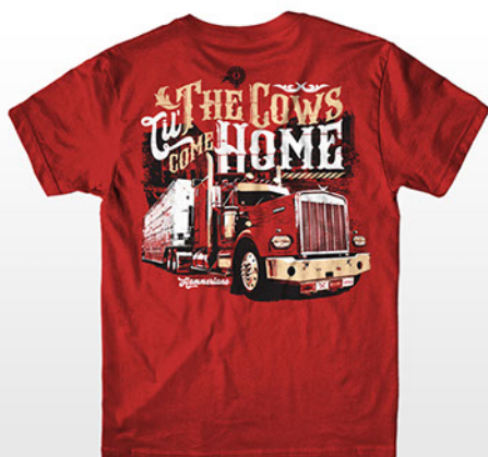
Til' The Cows Come Home.