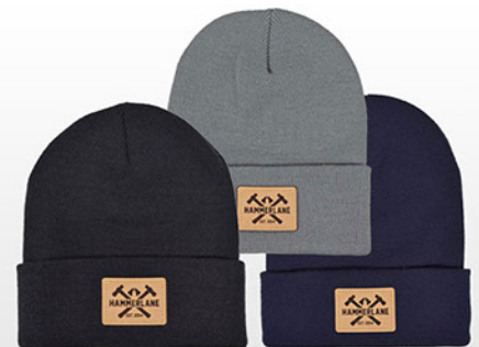
Hammerlane Patch Beanies