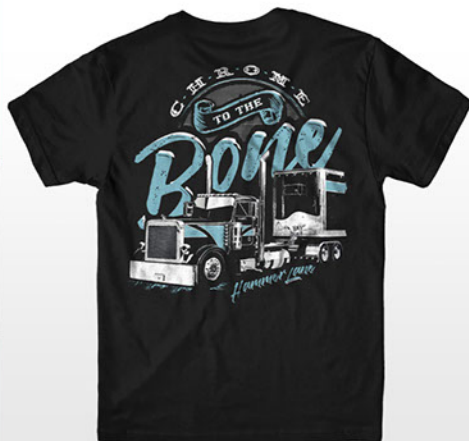
Chrome to The Bone.