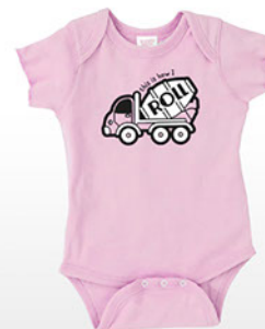
How I Roll Pink Onesie.