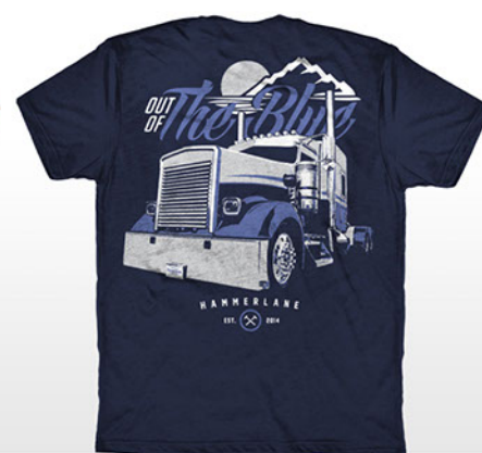
Out of The Blue.