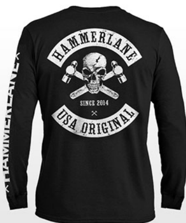
USA Original Skull LS