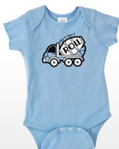
How I Roll Blue Onesie.