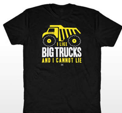
I Like Big Trucks.