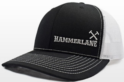
Black & White CH Snapback